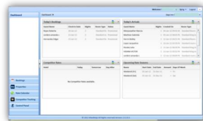
Revenue Mantra Home Page (Dashboard)